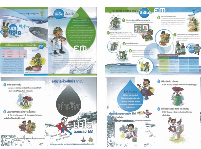
Fig. 5 EM water treatment leaflet